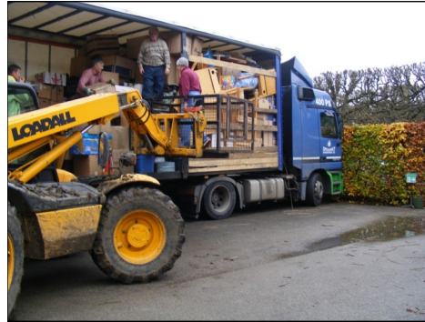
Samuel the lorry-loading in progress

On Friday 13th November, Samuel the Lorry was finally given the all-clear for travel to Moldova. A small team of people were available to load the lorry with all the aid that had been kindly donated. Items on this lorry included staffroom chairs, school tables, sports equipment, bicycles, toys, games and puzzles for the Health Centre, toys and educational equipment for all three schools and all the shoe boxes from last Christmas' appeal. The lorry is due to arrive in Moldova by November 23rd. Thank you to all the families who donated time and equipment.